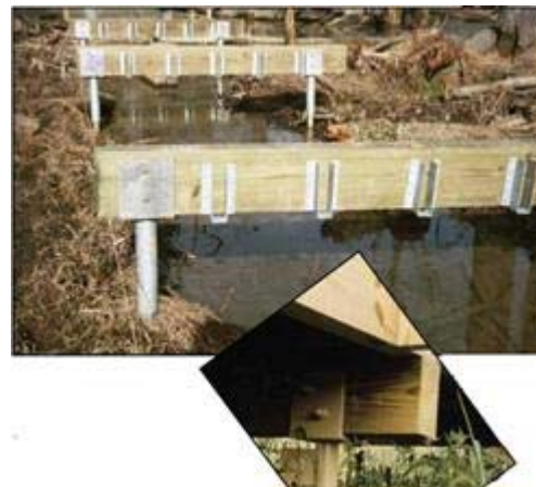
Figure 8: Helical Piers

The cost estimate (Appendix C) shows a slightly lower cost for the driven timber pile option compared with the helical piles. These costs should be reviewed in the final design phase to reflect current prices for steel and equipment. In our opinion, the reduced impact, narrower profile, and durability of the steel helical piers makes them a better choice for this location and justifies a modest added expense.