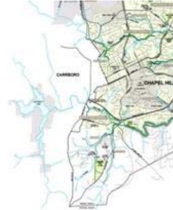
Figure 3: Chapel Hill Greenways Masterplan

The concept plan was developed using this data. The final stage in the process would be to seek approval of the Concept Plan by the Town Council. Upon Council approval, the Final Design phase of the Greenway can begin.