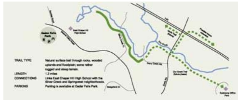
Figure 2: Dry Creek Trail Map Chapel Hill Greenway Trail Map

The alternatives discussed in this Concept Plan are consistent with the Chapel Hill Greenways Comprehensive Master Plan, adopted by the Town Council in January 2006 (Figure 3). The Concept Plan also provides specific recommendations for the construction of a pedestrian crossing at Erwin Road, a small, low-impact parking area on the west side of Erwin