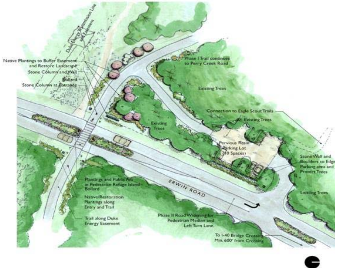
Figure 5: Parking Lot, Trailheads, and Pedestrian Crossing at Erwin Road

The first of these options is the preferred location for various reasons. This parking area could best serve visitors to the greenway, the existing Eagle Scout trails, and the future proposed 5-acre park.