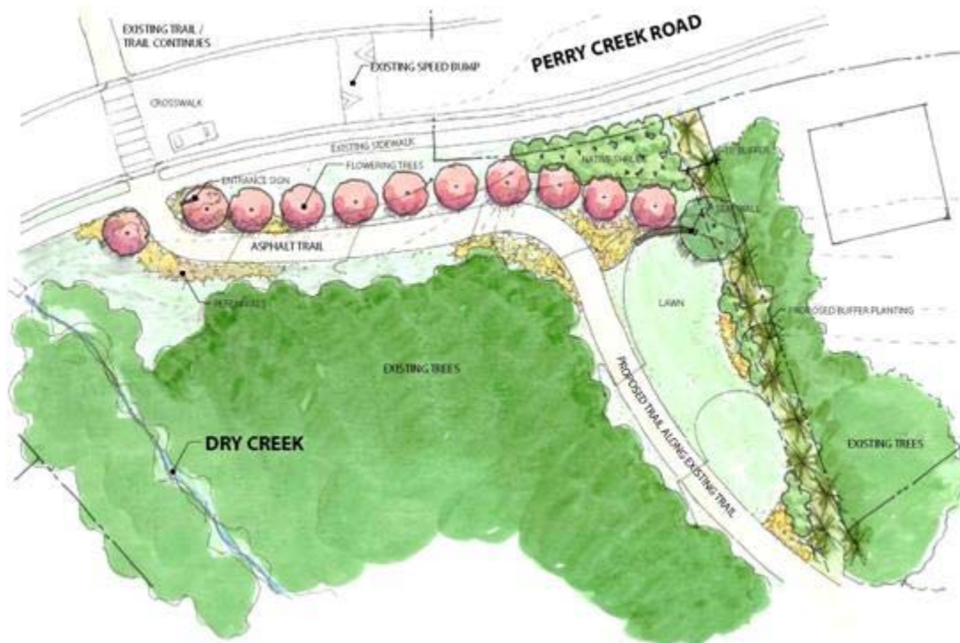
Figure 4: Trailhead and Grass Area at Perry Creek Road

The trail would use the existing bridge over Dry Creek to reach Town property on the north side of the creek. This bridge was designed and located with the intention to continue the trail along the north side of the creek and avoid disturbing several thousand feet of wetlands surrounding Dry Creek. Furthermore, locating the trail on the north side of the creek would allow direct access from the Springcrest neighborhood to a proposed neighborhood park site, the proposed parking lot, and the preferred location of a pedestrian crossing at Erwin Road.