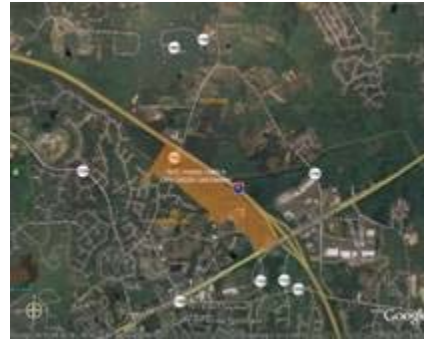
Figure 1: Context Map

The Dry Creek Greenway is located in northeast Chapel Hill within the Dry Creek watershed. Dry Creek is a major tributary of New Hope Creek (Figure 1). The existing portion of the Dry Creek Trail is a natural surface trail that runs 1.2 miles along the southern branch of Dry Creek and links East Chapel Hill High School to the Silver Creek and Springcrest neighborhoods at Perry Creek Drive (Figure 2). From Perry Creek Drive, the trail continues as a natural surface trail, over an existing bridge and then connects to a series of loop trails within a 34-acre parcel bought by the Town of Chapel Hill in 2000. This portion of the trail is approximately 2,100 feet long.