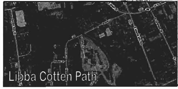
Libba Cotten Path